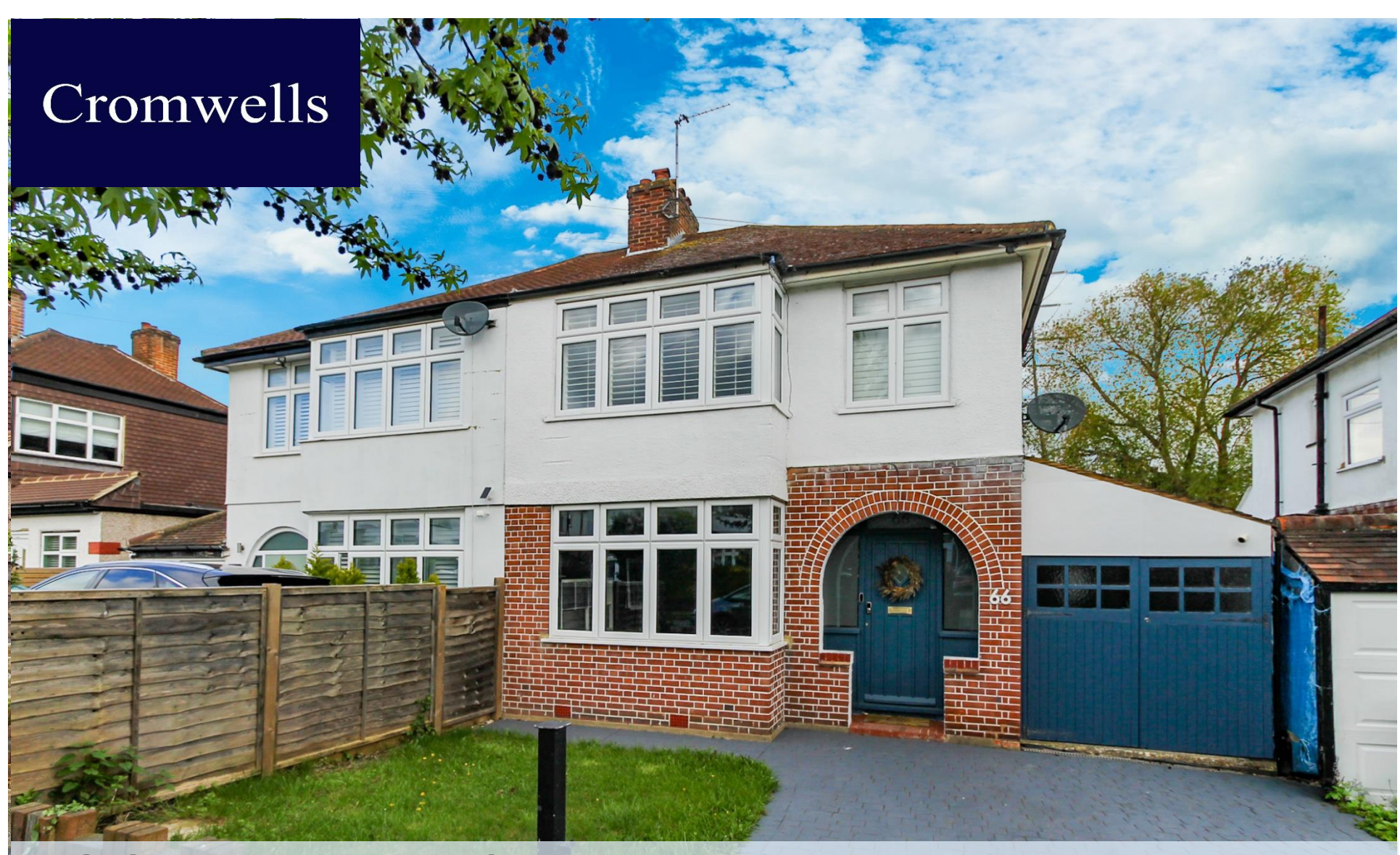
Brockenhurst Avenue, Worcester Park, KT4 7RF £790,000